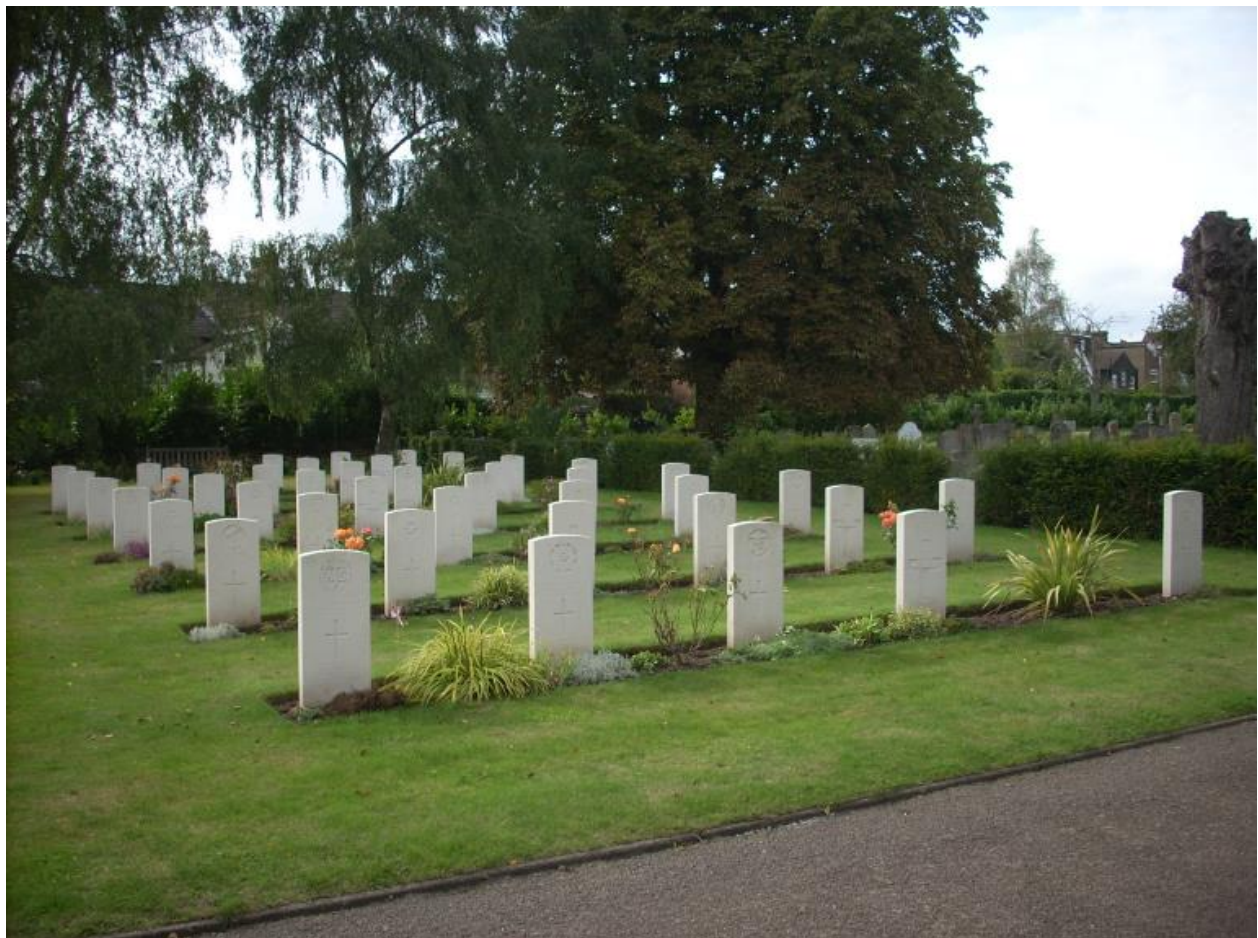
War Graves in Hatfield Road Cemetery, St. Albans