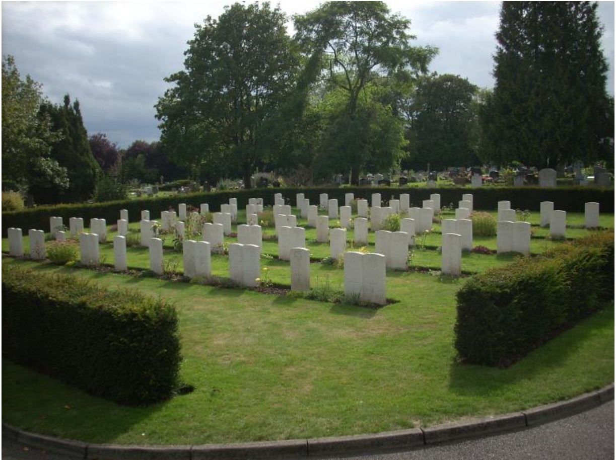
War Graves in Hatfield Road Cemetery, St. Albans